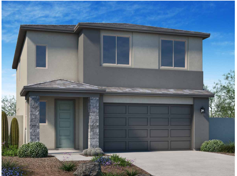
Elevation B - Modern