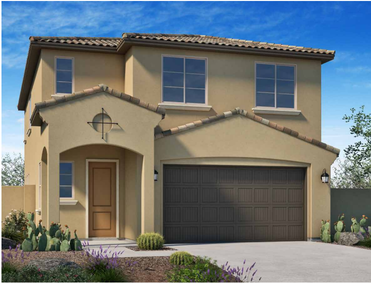
Elevation A - Spanish