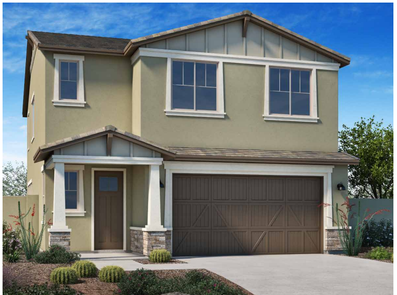
Elevation D - Craftsman

706 East Bell Road, Suite 212 | Phoenix, AZ 85022 | (602) 996-6800 | Developed by HBT of Marley Park LLC | Sales by Towne Brokerage Services, Inc.