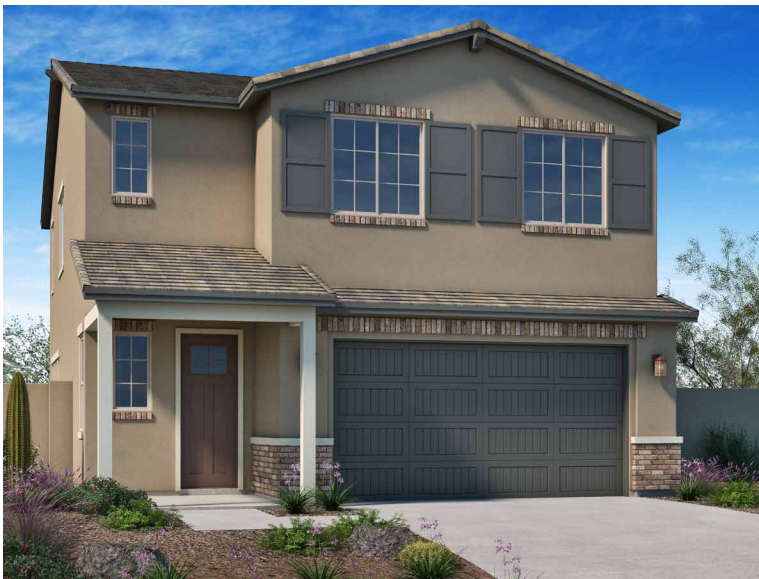
Elevation C - Traditional