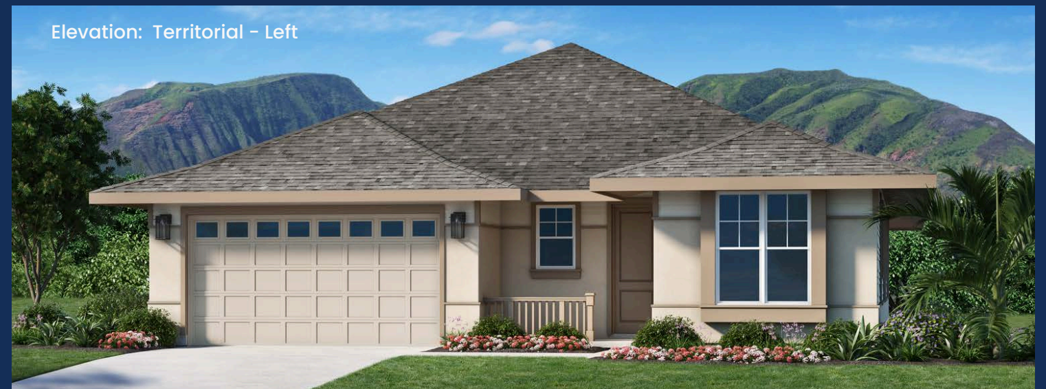
Elevation: Territorial - Left

Call us for more information (808) 243-3300