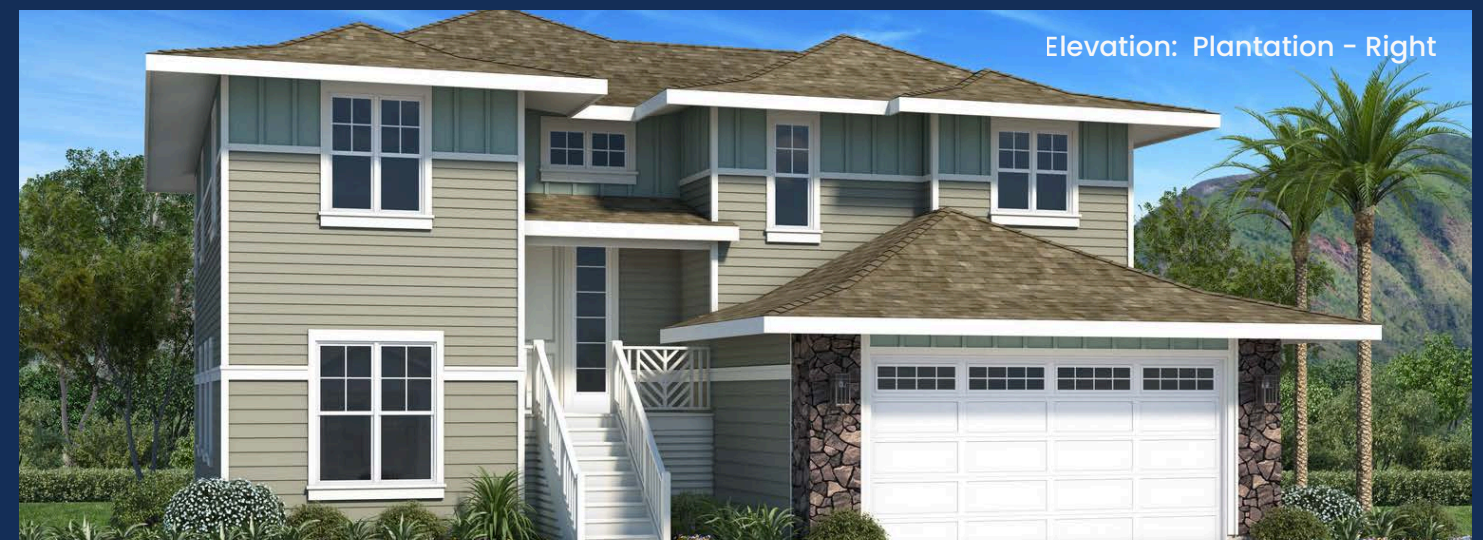
Elevation: Plantation - Right

Towne Island Homes® is the exclusive broker for The Parkways at Maui Lani, a development of HBT of Maui Lani LLC. The site plan is not intended as a legal description of the property or to constitute an undertaking by any party to develop the subject property as shown. It is for general informational purposes only and details shown may vary significantly depending upon actual field conditions and other factors. Developer reserves the right to modify overall site plan and product mix without prior notice. © 2026 Towne Island Homes®